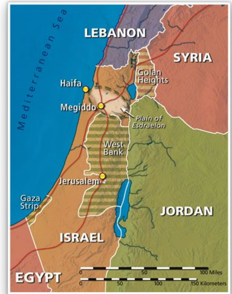
Megiddo was at the crossroads of several ancient invasion and trade routes (indicated in red) in ancient Israel. Megiddo overlooks the Plain of Esdraelon, which Bible prophecy indicates will be the gathering place of massive armies just before Christ's second coming. Those armies will fight the returning Jesus Christ near Jerusalem.